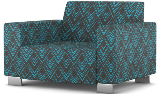
Shown: Kaolin AC-63324 Storm #25 Sukhala AC-63224 Caribbean #5